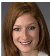
First Vice President, CBRE Topic: Office